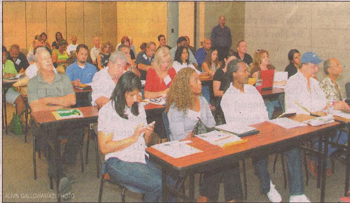
The number of attendees at the workshops nearly tripled what organizers had expected.

A child has to live in the home for it to be eligible for weatherization. In the 787 billion stimulus passed by congress in February the funds will increase the funding for the cities 33-year old project with a emphasis on energy conservation and the ability to help low-income families save on utility bills while getting America back to work.